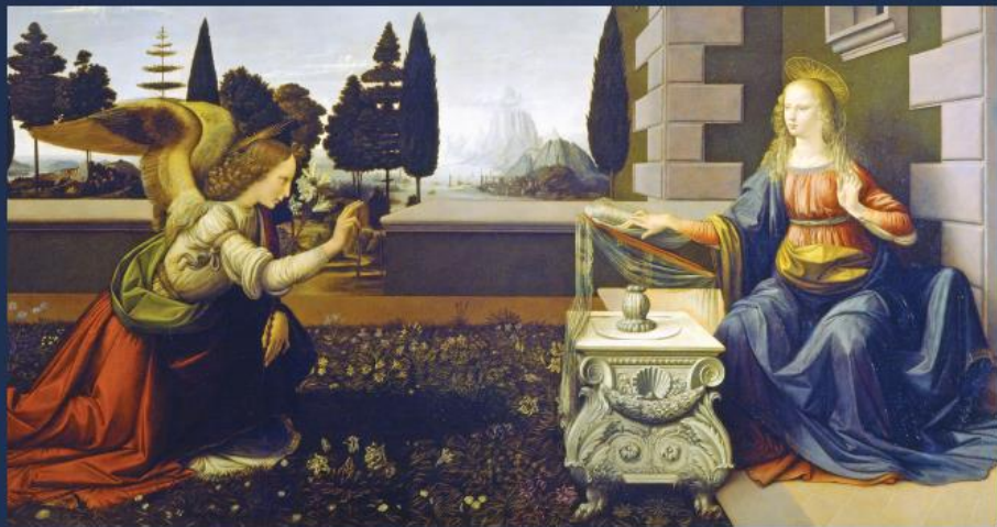
Leonardo da Vinci, The Annunciation , 1472, oil on panel