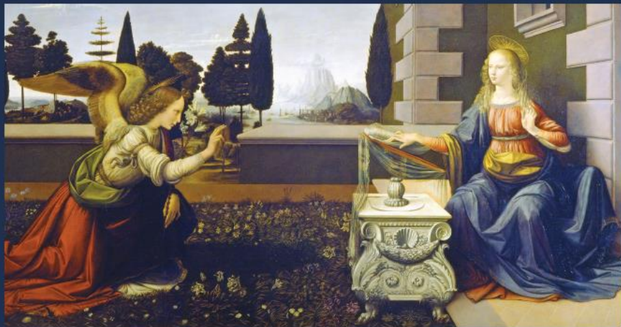
Leonardo da Vinci, The Annunciation , 1472, oil on panel